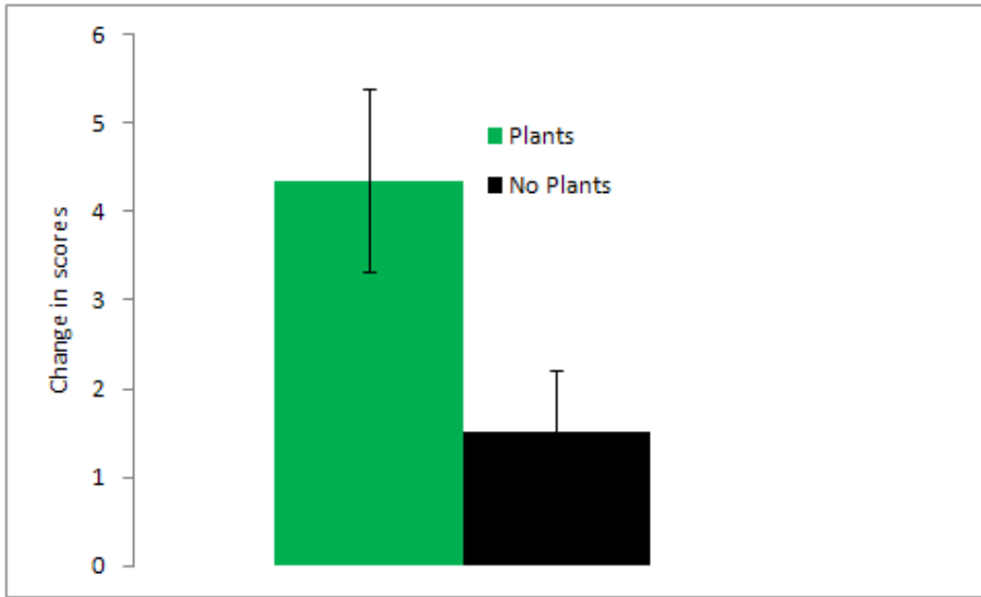
Figure 2. School A: Comparison of end of term spelling scores, in classes with and without plants.(Means and SE; n = 69-72.)